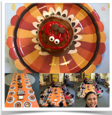
Thanksgiving Celebration 2018